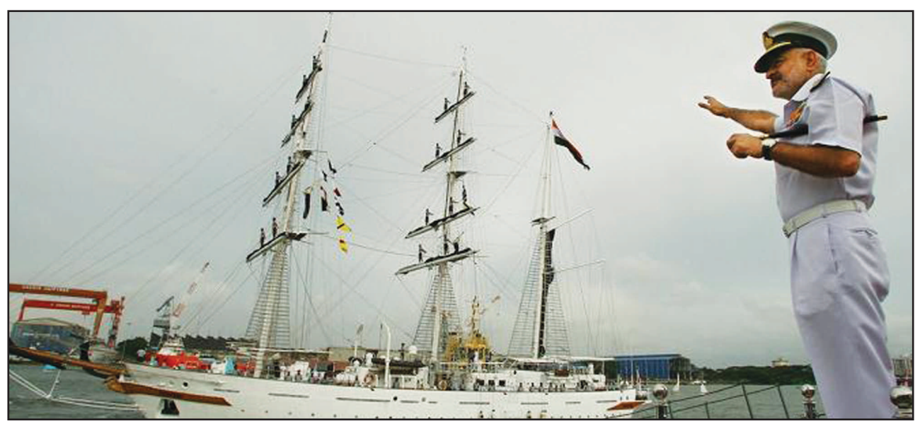
Flag Off by The Chief of The Naval Staff

INS Sudarshini's voyage would not only trace the civilisational and historical links between India and South East Asia, but, more significantly, would also mark the contemporary maritime linkages of trade and technology, which are today contributing to the human resource development and the economic growth of India and ASEAN countries. During the course of the 12,000 mile expedition of INS Sudarshini, she will visit 13 ports in nine countries in South East Asia. The ship will visit the ports of Padang, Bali, Manado (Indonesia), Muara (Brunei), Cebu, Manila (Philippines), Da Nang (Vietnam), Sihanoukville (Cambodia), Bangkok, Phuket (Thailand), Singapore, Port Klang (Malaysia) and Sittwe (Myanmar). Various cultural and business events, in addition to people to people interactions, are scheduled during the stay of the ship in these ports. International trainees will embark on board in different legs of the voyage from ASEAN countries to strengthen Navy to Navy ties. The ship will return to Kochi on 29 March 2013.