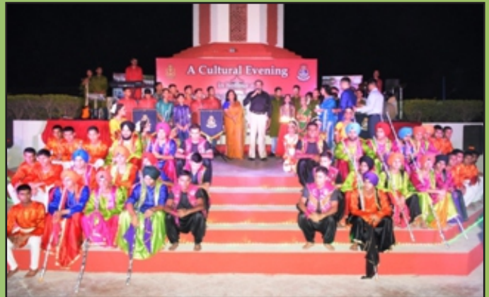
Cultural Evening for COM