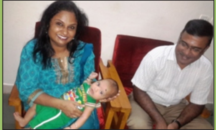
Visit to New Born Baby