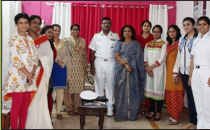
CO Interaction with NWWA Ladies