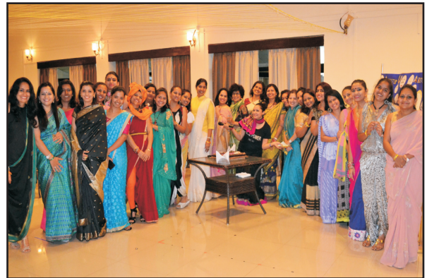
Saree with a Twist