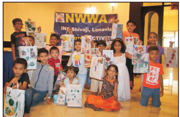
Starting early with Environment Conservation