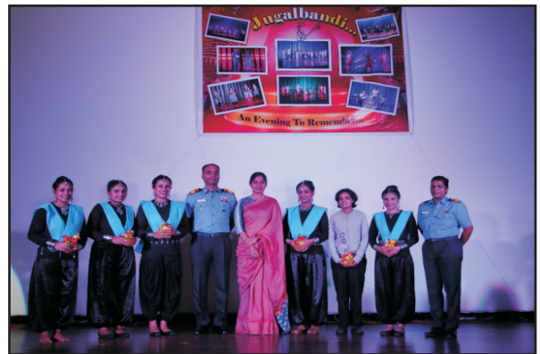
NWWA Ladies participating in full strength