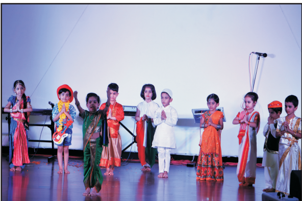
Little ones shine at the Monsoon Concert