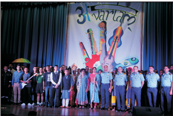
Team Shivaji at the Monsoon Concert