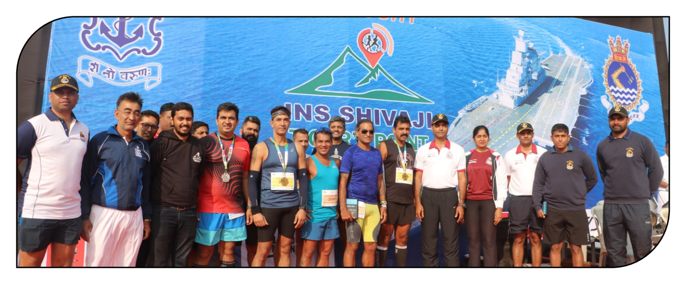
INS Shivaji Tigers Point Hill Challenge Half-Marathon