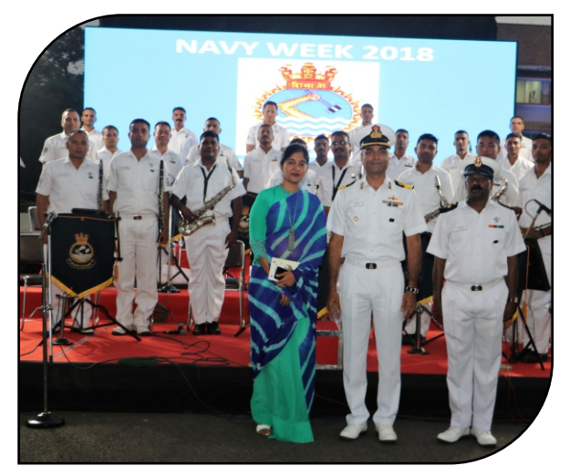
Our pride - The INS Shivaji Band