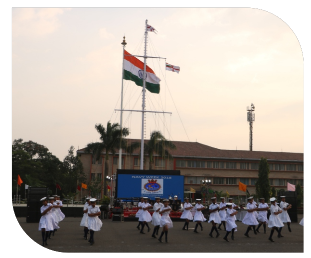
Sea Cadets enthralling all at the Beating Retreat ceremony