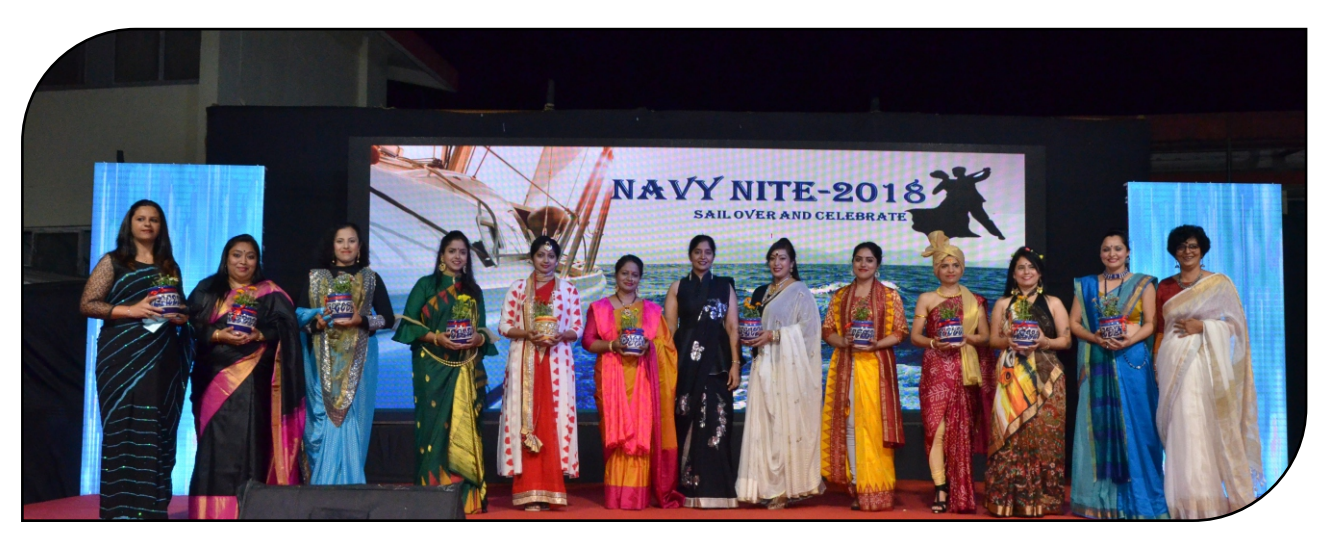
Navy Nite - Fashion Show Divas