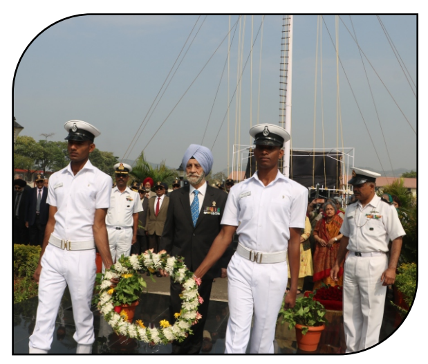
Navy Foundation Day