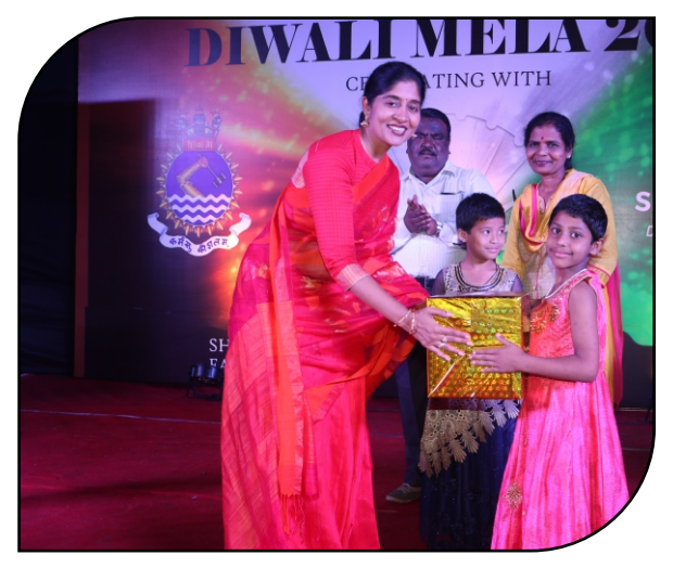
Lighting up lives with smiles at the Diwali Mela