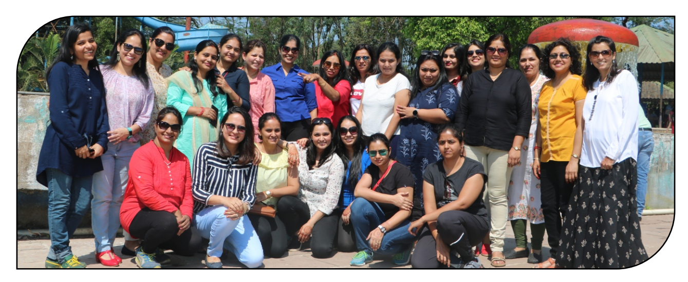
Together at Station Lonavla Annual Picnic