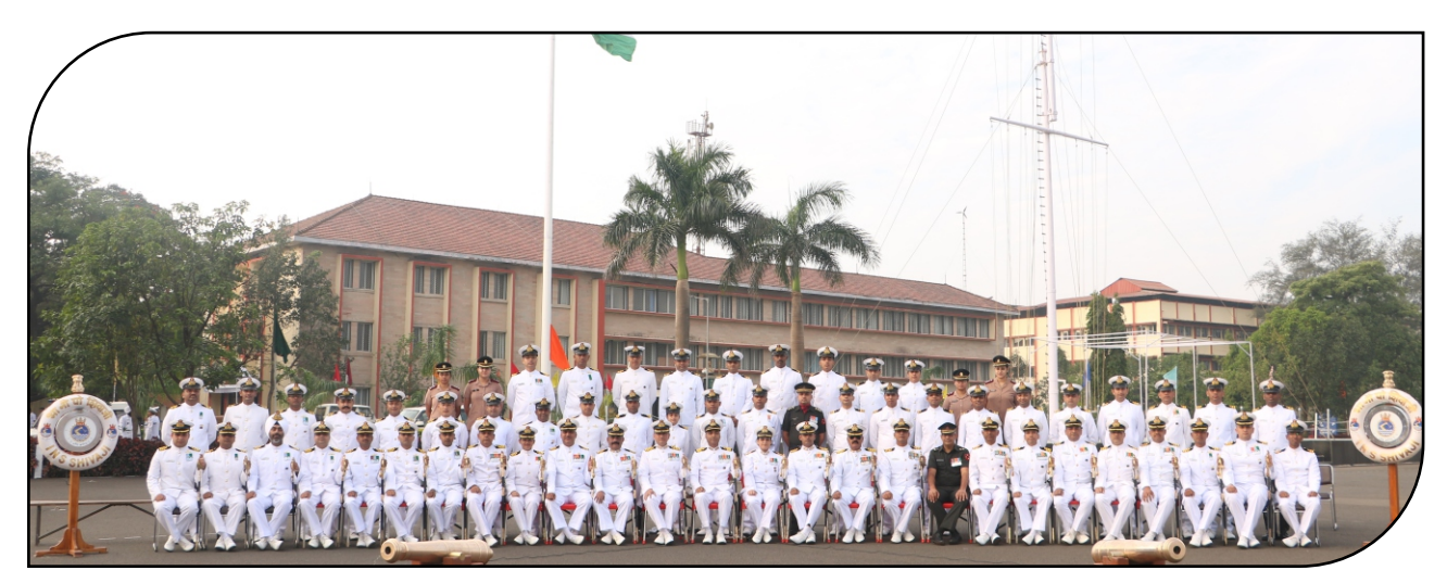
Pride, Honour & Respect