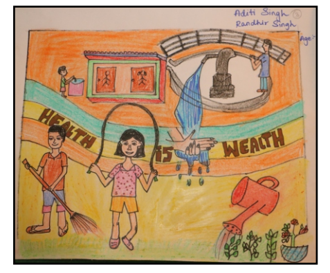
ADITI SINGH, 2ND