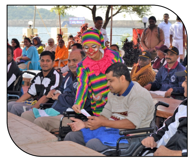
Picnic and lunch with NRC Kirkee families at WTC