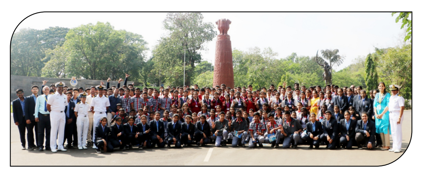
Children from Sinhagad, Raigad and Kendriya Vidyalaya schools at Pratigya Sthal