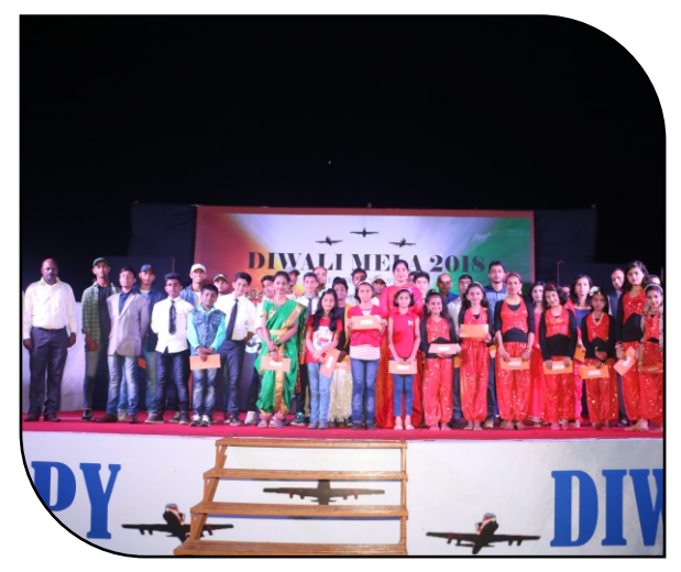
Station Lonavla family at the Diwali Mela