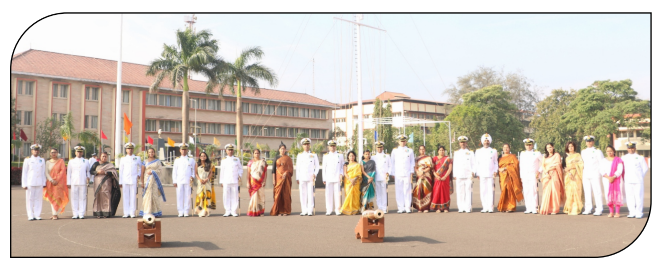
Standing tall on Navy Day